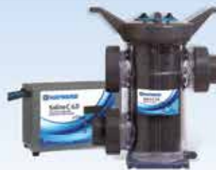
Chlorine dispensing for sanitizer control