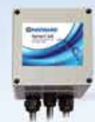
Junction box for sanitizer back-up