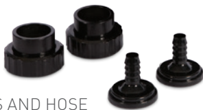
UNIONS AND HOSE BARB ADAPTERS

With 1½" union fittings, the Hayward Booster Pump is easy to install and remove. Its ¾" hose barb union adapters and flexible hose make retrofitting in existing pool pads simple.